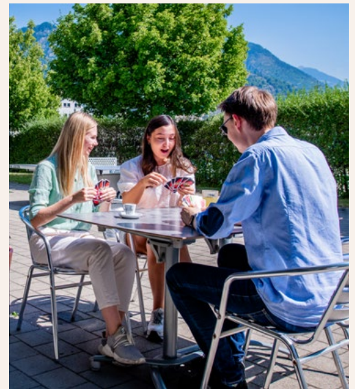
PATIO Brig campus