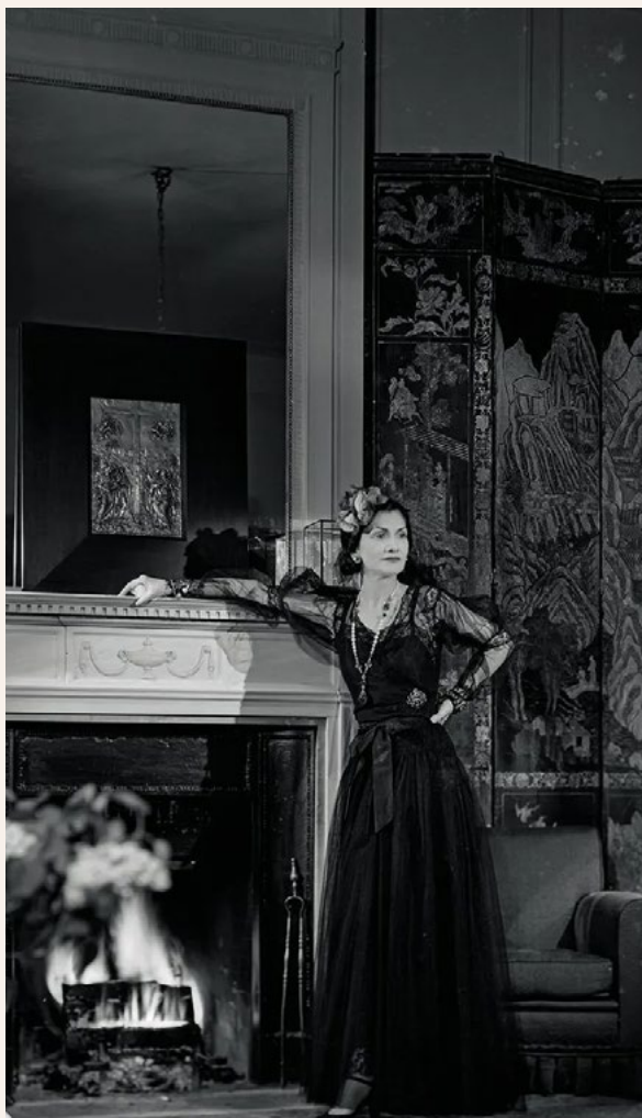
Coco Chanel at Le Ritz Paris.