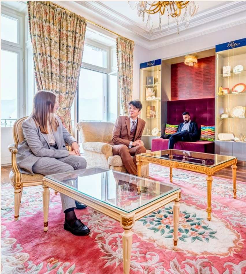
STUDENT LOUNGE Le Bouveret campus