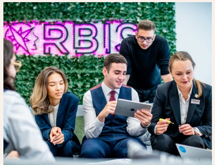
Students in the ORBIS Innovation Lab